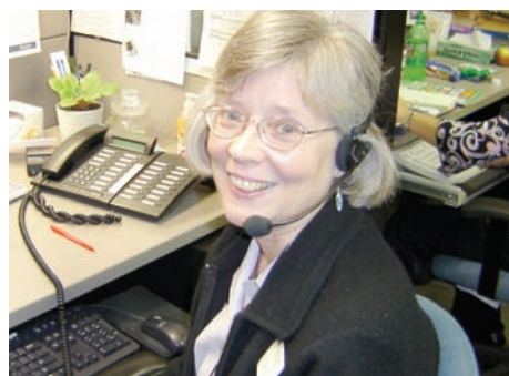
CUTCO customer service

We care for our customers in many ways, including in-home service calls by Sales Representatives who offer sharpening and other services, as well as our skilled customer service representatives at our headquarters in Olean, N.Y. The CUTCO ideal of stellar customer service is contained in our Forever Guarantee, which, provides for free sharpening forever.